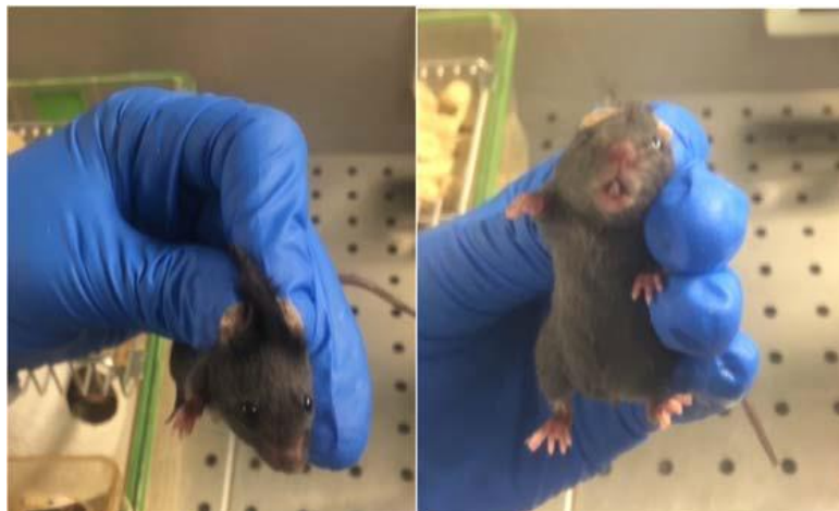
Figure 1 Appropriate restraint for this technique (UQBR 2019).

The inferior facial vein can be located by using the ‘hair whorl’ that is distinguishable on most rodents. Move away from the nose and above this landmark. Puncture can be performed on either side of the head.