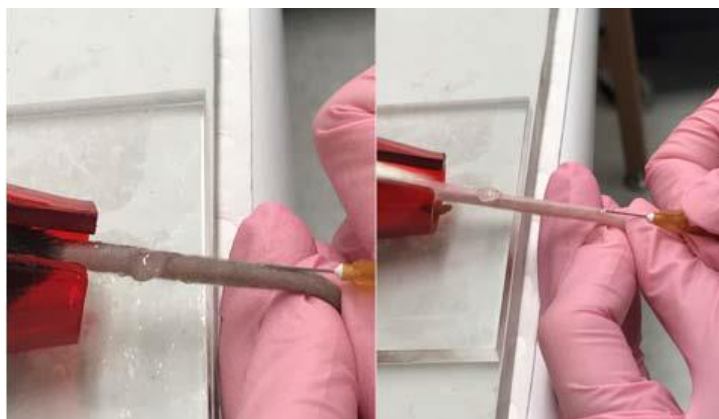
Figure 3 – Puncture of the lateral tail vein, via the “tail prick” technique .

The initial site of venepuncture should be made in the distal portion of the tail (i.e. close to the tip of the tail). This is because if repeat blood collection attempts are required, they should be made proximal to the previous venepuncture site.