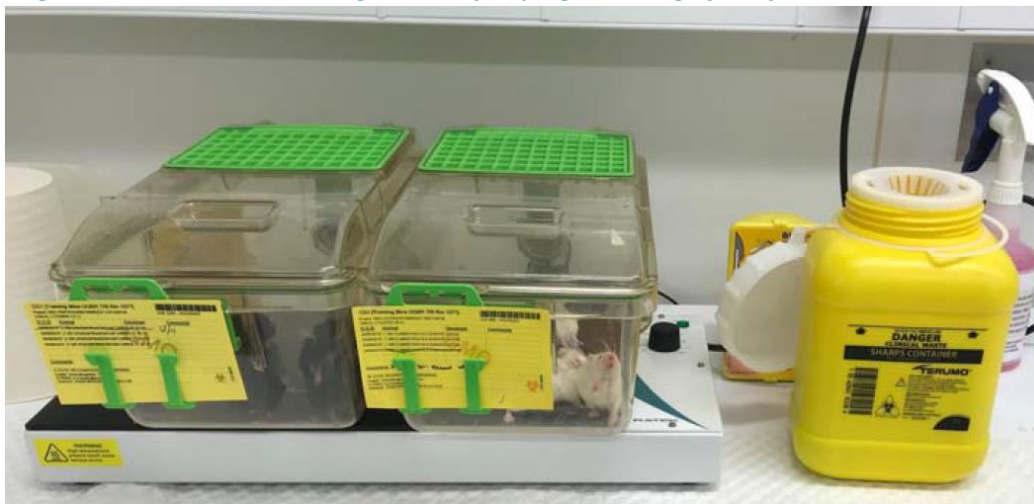
Figure 1 – Mice on a heating plate

Rodents that are experiencing mild-moderate “overheating” may demonstrate redness of the ears and muzzle, and agitated behaviour, including unusual jumping, cleaning of the face and ears, and head shaking.