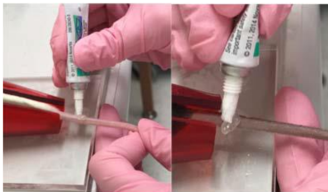
Figure 2 - Applying lubricant to the tail