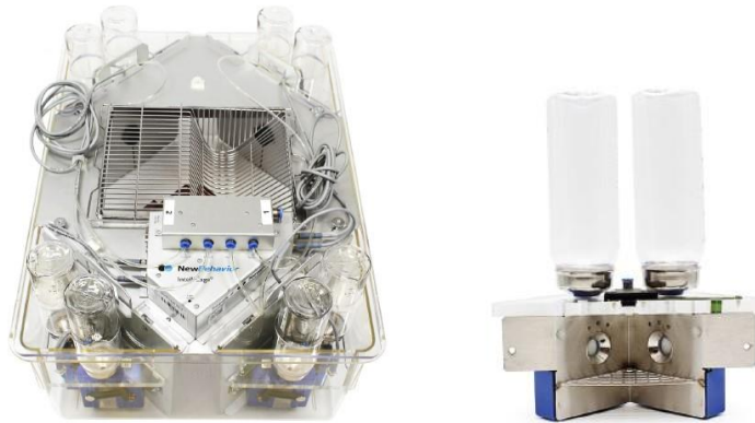
Figure 3: IntelliCage chamber (left) and operant corner (right).