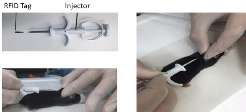
Figure 4: RFID tag and injector.

5. Pinch and lift the loose skin at the back of the neck and shoulders creating a tent. Insert the injecting needle through the skin parallel to the spine, bevel facing up. Eject the microchip subcutaneously (Figure 4).