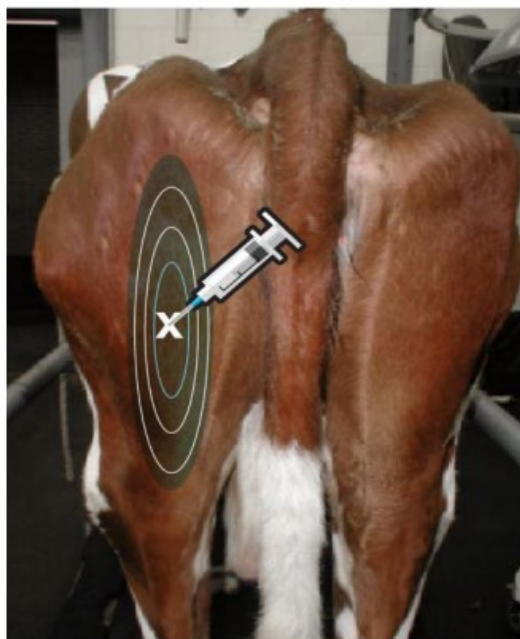
FIGURE3: Intramuscular injection zone: THIGH