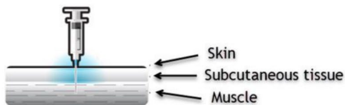
FIGURE 2: Intramuscular injection site